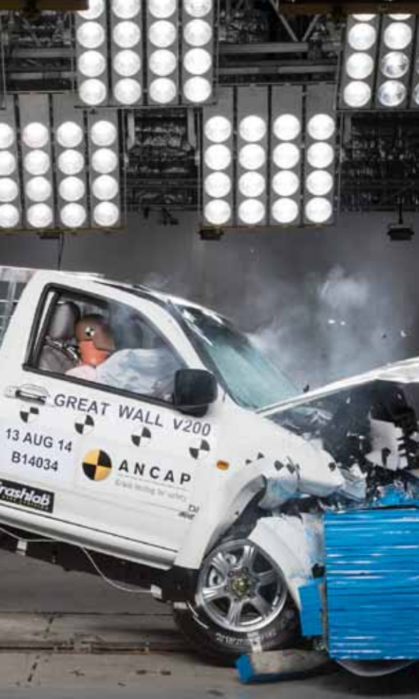
Great Wall Motors V200 4x4 single cab (2011-onward) 3 star ANCAP safety rating