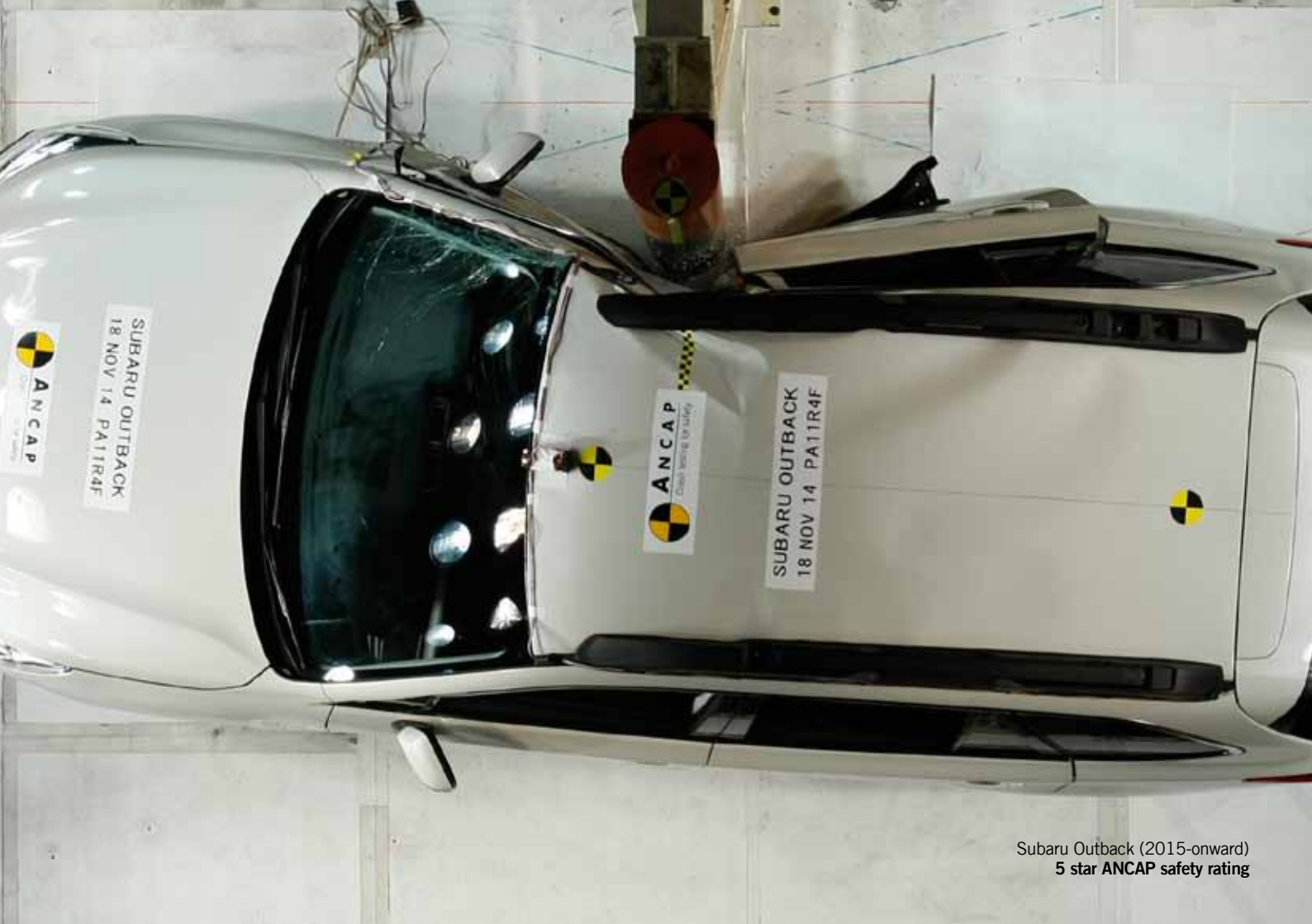
Subaru Outback (2015-onward) 5 star ANCAP safety rating