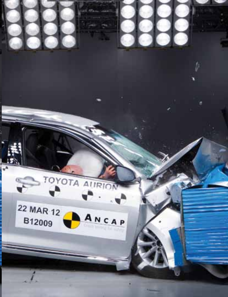
Both vehicles: Frontal offset test at 64 km/h